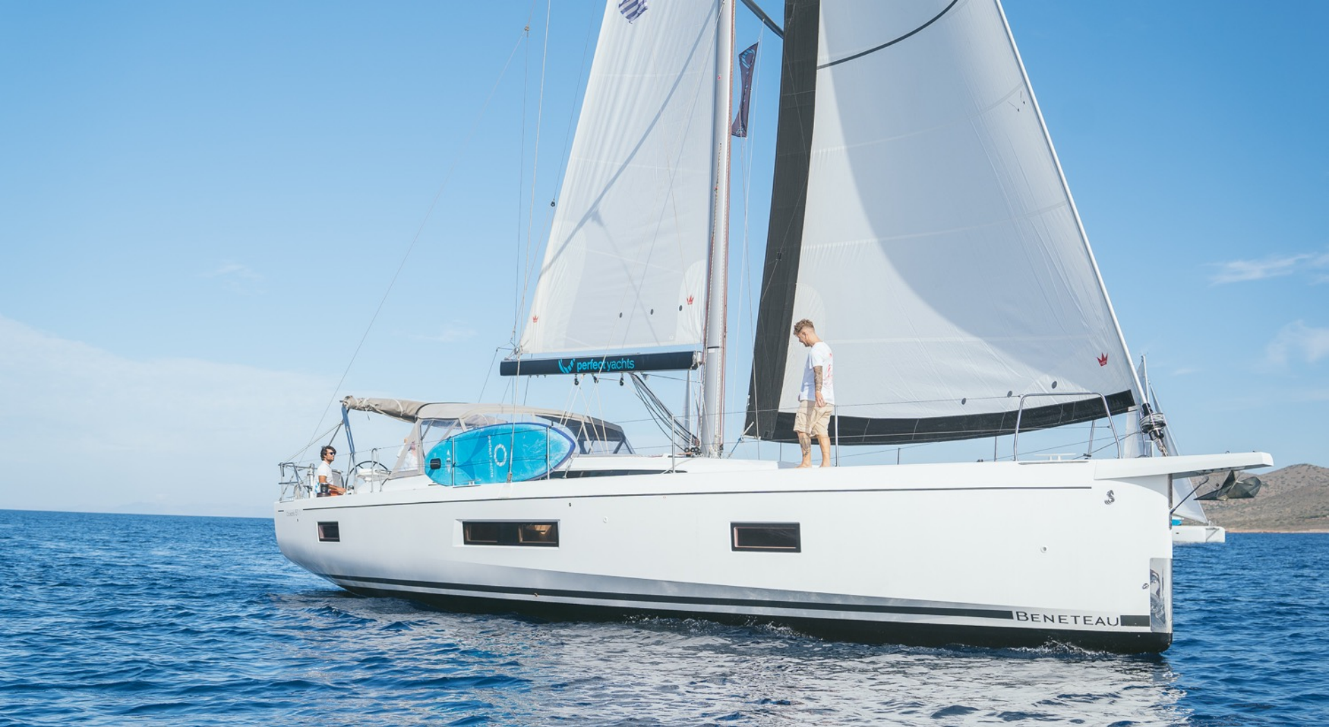
Princess Oceana - Beneteau 51.1